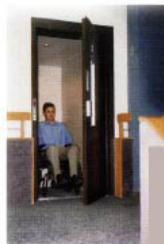
This is a typical Voyager with two hour UL/ULC Fire Rated Door with concealed automatic door opener for virtually hands-free operation.

A variety of cab finishes and colors allow you to customize the cab design to satisfy your personal needs.