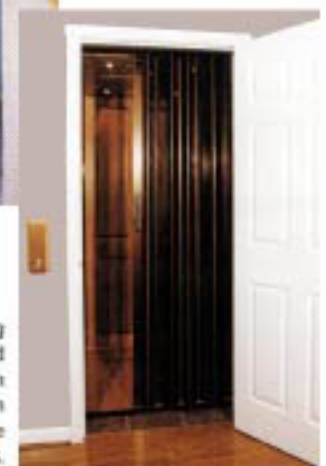
Optional solid folding gate with either solid rattan panels with three acrylic vision panels or all bronze colored acrylic panels.