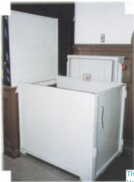
The "Stage" Vertical Platform Lift

Wright & Filippis specializes in customized vertical platform lifts to fit your needs, wants or desires. Let us know what we can do for you!